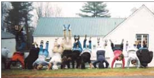
A SCAVENGER HUNT??? It may not look like one, but we promise, it is!